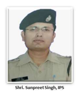
Dy. Commissioner of Police L.B. Nagar, Rachakonda onvenor Cyber Security Forum - RKS